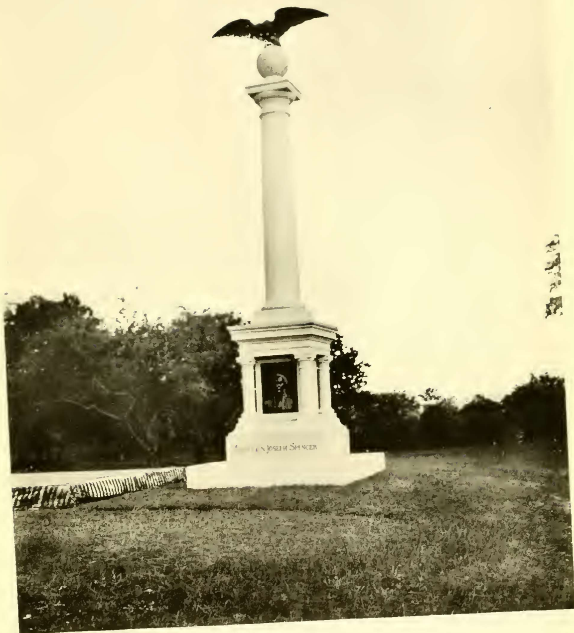
The exact inscription on the Spencer Monument is as follows: — "Erected by the State of Connecticut In Memory of the Honourable Joseph Spencer Esq. Major Gen. of the Army of the United States of America: Elected Counsellor of the State of Connecticut May 1766 and died in office Jany. 13th 1789 in the 75th Year of his Age."